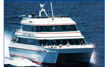
Mackinac Island Ferry