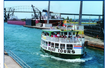
Soo Locks Cruise in Sault Sainte Marie