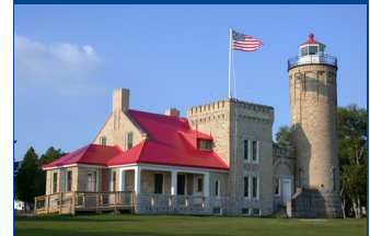
Mackinac Point Lighthouse